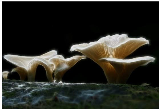
Randy Dinkins' First Place shot

Start thinking about what you like to shoot - we are soliciting topics for next year's competitions and will be collecting surveys at the Club meeting.